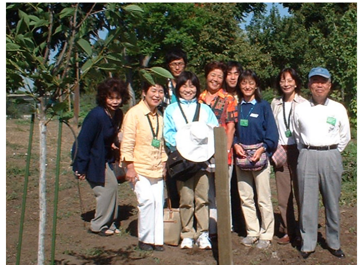
Here is the Osaka delegation at the Friendship Forest. The tree planted in their honor is in the left foreground.