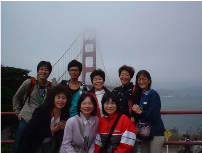
Osaka guests in front of the fog-shrouded Golden Gate Bridge.