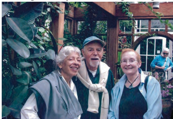
Conservatory of Flowers in San Francisco.

The magic of this dynamic design was created by the members of the Bay Area Garden Railway Society (BAGRS). We enjoyed the "Spin Wheel Quiz," which had us all seeking objects that composed the various components of structures. Everything was made from recycled "Stuff." From the Ghirardelli Square to the Golden Gate Bridge, Coit Tower to Chinatown's dragon gate, replicas of San Francisco's most famous places had been creatively crafted from recycled and re-purposed materials. Corks, wine boxes, cheese graters, cutlery and more came together to make San Francisco's gourmet haven, the Ferry Building. The towering Transamerica Pyramid was studded with over 600 computer keys. Debuting this year were eight new landmarks including San Francisco's City Hall, the Palace of Fine Arts, the Castro Theater and more—all set amongst miniature gardens and parks to create a magical setting.