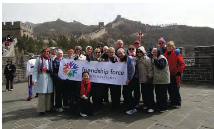
China Discover Trip