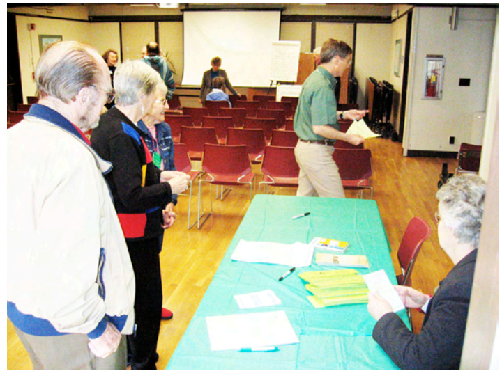
Preparing for a large crowd, in the Bechtel International Center at Stanford University, on April 22.