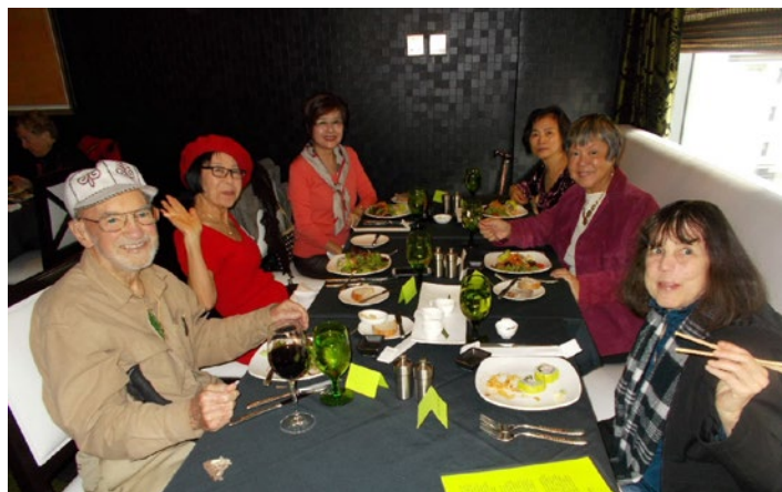
Holiday Party, Hotel Nikko