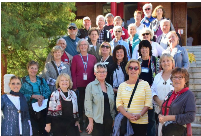
Ambassadors in Victoria, B.C.