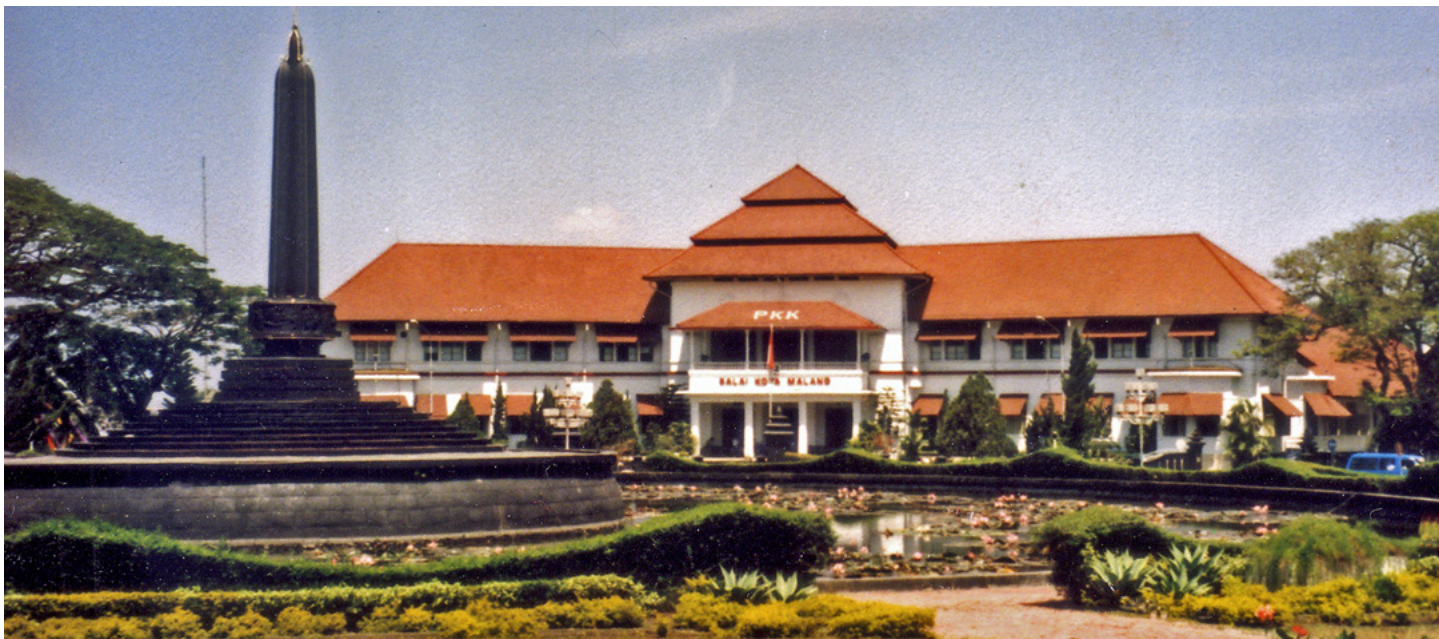
Malang Town Hall